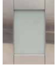
SEAFOAM GREEN SEA GLASS INSERT