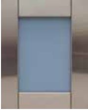
SKY BLUE SEA GLASS INSERT