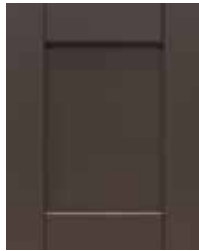
METALLIC BRONZE MATTE