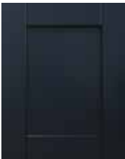
PEARL NIGHT BLUE