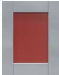
KEY WEST FROST