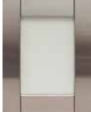
CLOUD WHITE SEA GLASS INSERT