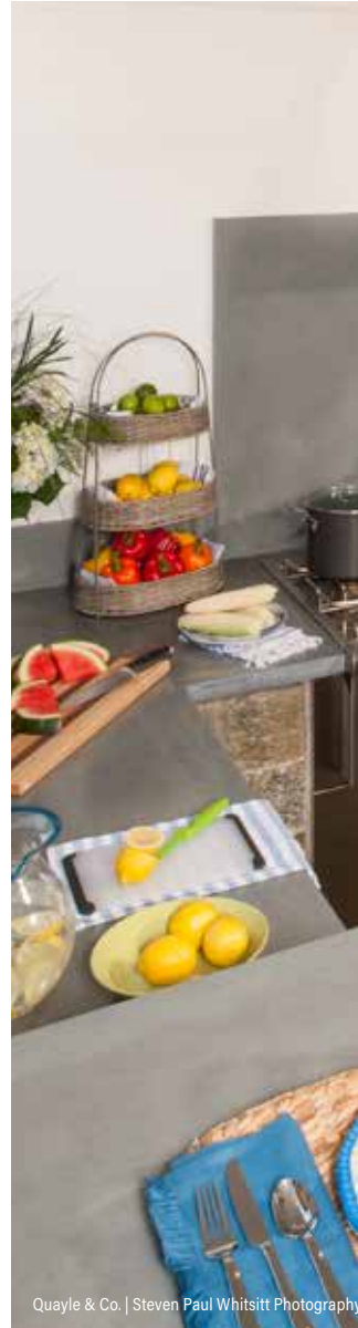
Quayle & Co.